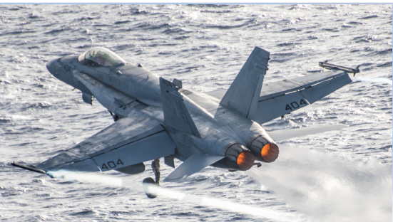
Boeing F/A-18C/D Hornet