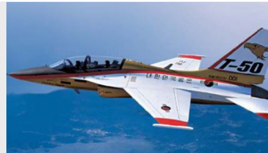
KAI/LMTAS T-50 Golden Eagle