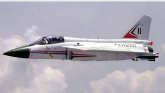
HAL Tejas MKI Light Combat Aircraft