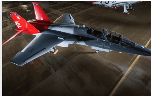
Boeing T-7A Red Hawk